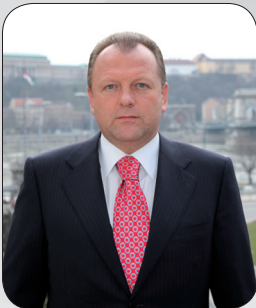
Marius L. VIZER IJF President